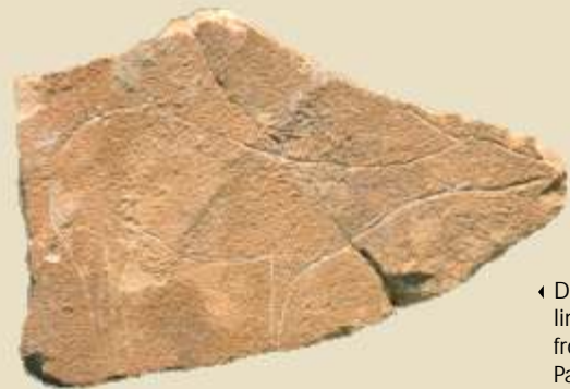
Decorated limestone plaque from la Cova del Parpalló (Gandía). 18.000 years BP

The Upper Paleolithic saw the appearance of art: delicate, stylised animal designs painted on cave walls or engraved on bone and flat pieces of stone as well as decoration of bone tools or different types of personal adornments. La Cova del Papalló (Gandía) has provided a magnificent collection of more than 5000 engraved and painted limestone plaques presenting the evolution of techniques and themes typical of the societies of the Upper Palaeolithic between 25.000 and 10.000 years before the present.