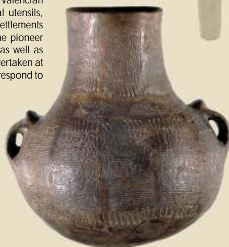
Vase with impressed decoration from la Lloma de Betxí (Paterna). 1.800 BC

In the II millennia BC the Valencian lands were extensively populated with the predominance of small mountain-top settlements. The Valencian Bronze culture was characterized by generalized use of metal utensils, initially copper and later bronze ones. Materials found at such settlements as el Mas de Menente and la Mola Alta de Serelles (Alcoi), the pioneer excavations carried out in the first decades of the XX century, as well as materials gathered from more recent excavation campaigns undertaken at la Lloma de Betxí (Paterna) or la Muntanya Assolada (Alzira) correspond to this culture.