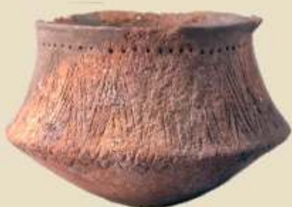
Jug with cardinal decoration from the Cova de l'Or (Beniarrés), 5.500 BC